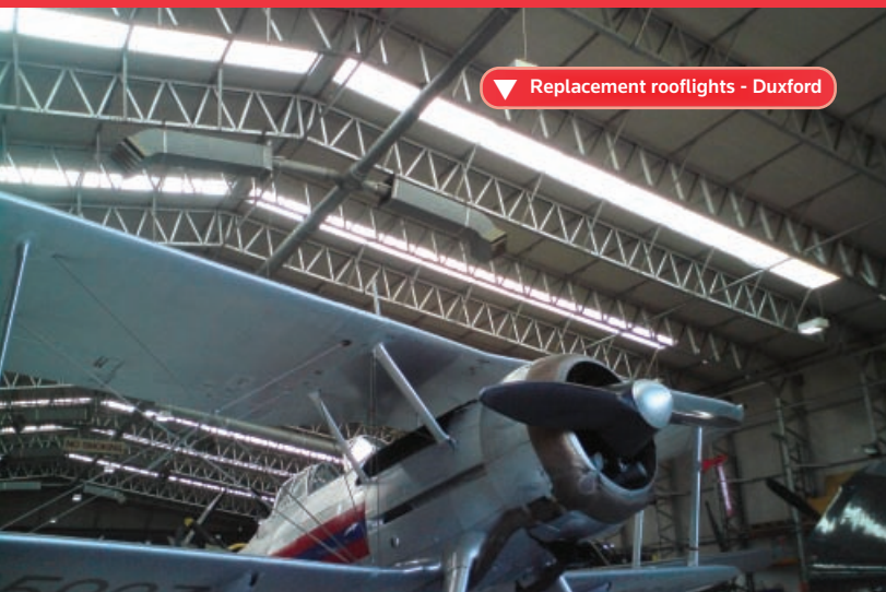
Replacement rooflights - Duxford